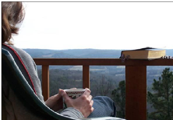
Saturday, July 30 th