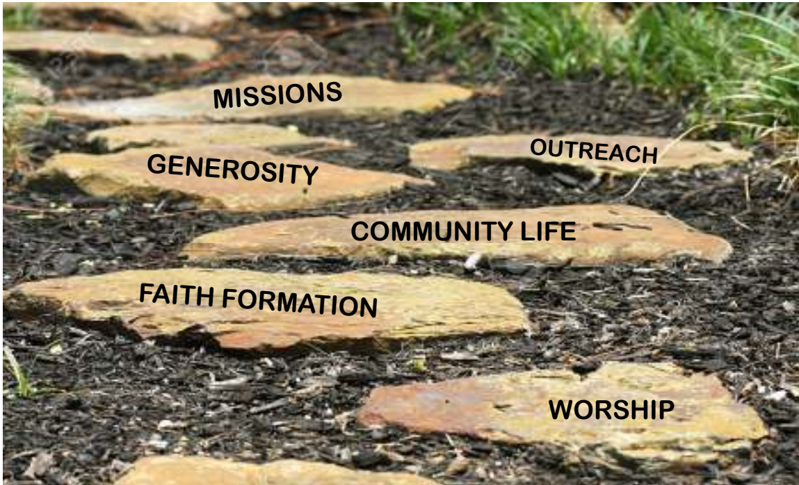
The Stepping Stones of our Discipleship