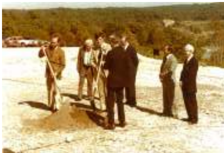
Ground Breaking Ceremony October 9, 1977