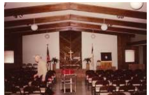
Fellowship Hall/ Sanctuary circa 1978