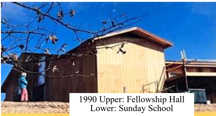
1990 Upper: Fellowship Hall Lower: Sunday School