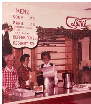
Check out those prices at the 1978 UMW Bazaar!