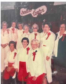
UMW Bazaar 1978