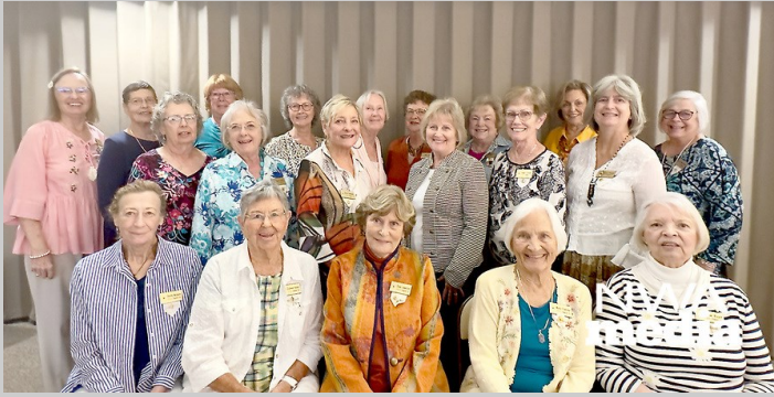
PEO Chapter CX 30th Anniversary Celebration

Look who made the local papers recently: