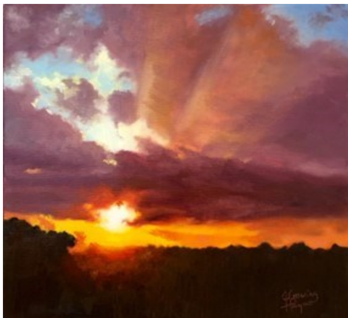
“Morning Glory” an original oil painting by Julie Gowing Hayes.

The clocks have mostly been reset (those we can reach and know how to reset) and we realize November is here and Thanksgiving is fast approaching. Thanksgiving is a season of thankfulness and gratitude. A disciple works to recognize every day is one of gratitude. On the days with glorious sunrises, it is easy to see the wonder of God’s Creation and be thankful. But when the morning light makes us aware of the damage of a storm overnight, it can be hard to be grateful.