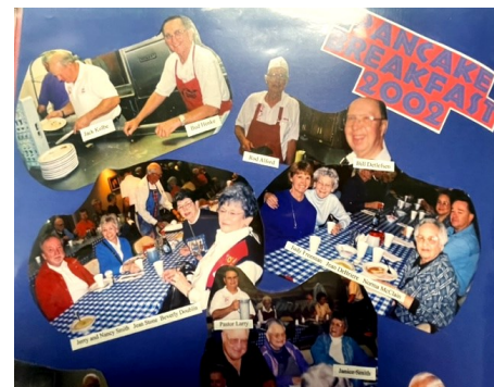
UMM Pancake Breakfast, 2002