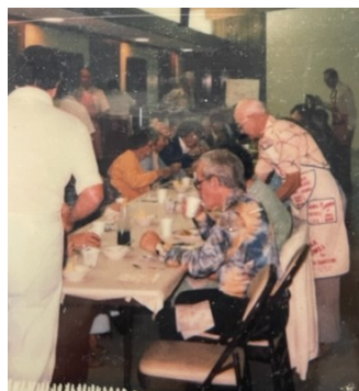
Serving pancakes, UMM 1979