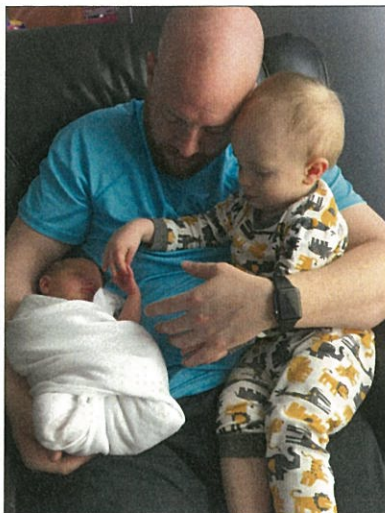
The Love of Family