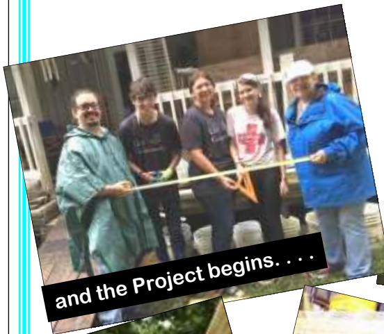
and the Project begins. . . .