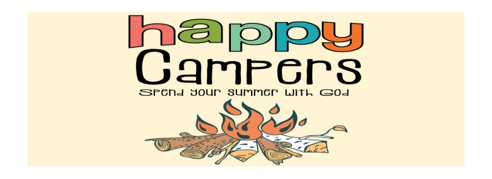
TELLING CAMPFIRE STORIES

Make It Stick: Tune into a Christian radio station in your car and sing some songs to God as a family. Or forget the radio and just sing praise songs on your own!